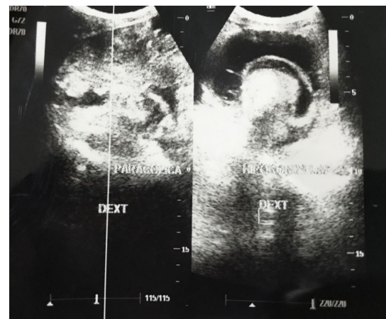
Figure 2. USG showed target lesion in transversal view

Emergency laparotomy was performed. Intraoperative findings showed ileocecal intussusception, and due to ischemic colon caused by intussusception, right hemicolectomy and anastomosis to transverse colon were performed. Specimen was not examined for histopathology due to the limited setting. No visible lead point was identified during the operation. The post operative course was unremarkable. Return of normal bowel function was found on his second postoperative day. Patient was self discharged five days after the operation.