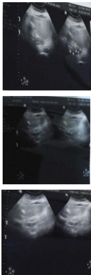
Figure 1. Ultrasonography showed fatty liver with no dilated duct

The gallstone was not found in the laboratory, USG, and CT scan examination. However, we still suspected that gallstone is the etiology, so we decide to undergo ERCP compare to MRCP procedure. None of ERCP and MRCP examination were more superior, but ERCP gives a better therapy effect than MRCP in evacuating the stones. The result of ERCP showed a multiple choledocholithiasis and chronic cholecystitis. The multiple choledocholithiasis evacuated and the clinical outcome was improving.